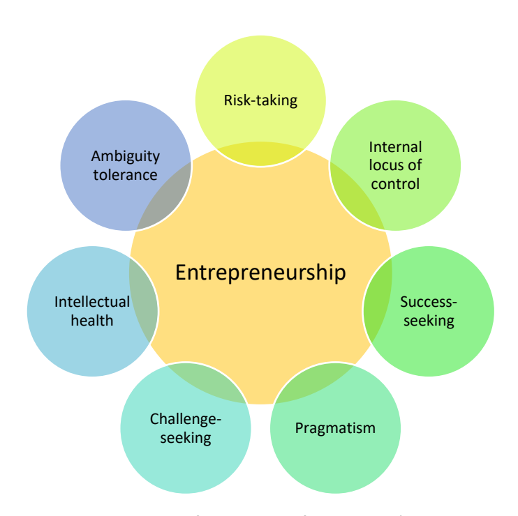
Figure 1. The theoretical framework of this study (Kurdnaij et al., 2006)

In this research, the model developed by Kurdnaij et al. (2006) for measuring the personality traits of Iranian entrepreneurs was utilized to evaluate the entrepreneurial traits of English translation students at Islamic Azad Universities in Mazandaran Province (see Figure 1). This model targets seven specific traits for measurement: risk-taking, internal locus of control, success-seeking, pragmatism, challengeseeking, intellectual health, and tolerance of ambiguity.